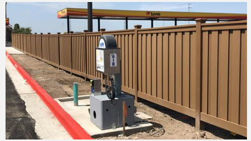
Love's Travel Stop - Donna, TX

All other design elements merge form with function as well. The 5x5 universal posts are wider than the typical 4x4 wood post, giving them not only additional strength but a statelier appearance. The top rail is thick and contoured, which provides lateral strength to resist high winds as well as an attractive cap-and-trim look. The heavy gauge aluminum bottom rail provides the fence with tremendous vertical and lateral rigidity. When sleeved with the bottom rail covers, a consistent look with the composite pickets is achieved and the covers create a picture frame appearance in concert with the posts and top rails. Trex Seclusions does not require many fasteners to begin with and the few that are needed are well hidden.