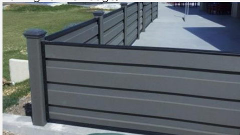
Bear Lake Marina - Garden City, UT