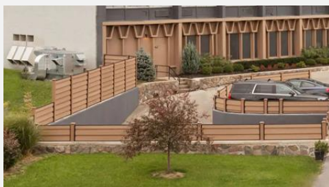
Wyndham Hotel - Niagara Falls, NY