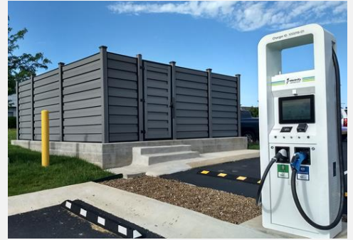
Supercharger - Bowling Green, KY