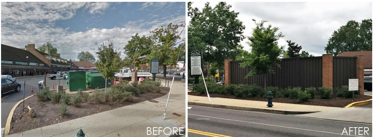
Fairfax Village Shopping Center, Washington, DC

Trex elevates outdoor spaces with low-maintenance, high-performance, eco-friendly products. Trex fencing offers aesthetically pleasing, value-oriented solutions.