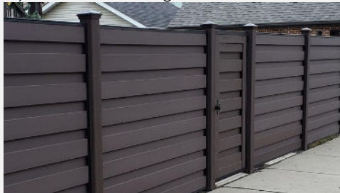
Parking Lot - Chicago, IL