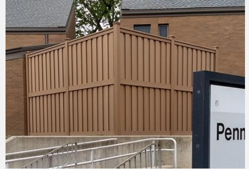
The Ohio State University – Columbus, OH