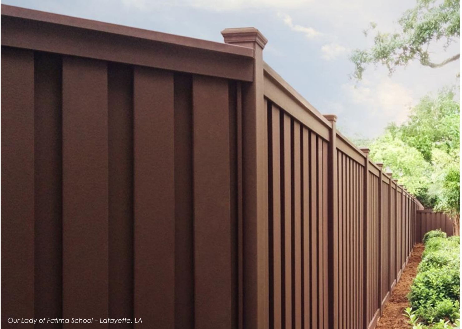
Our Lady of Fatima School – Lafayette, LA