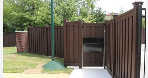
Goddard School - Elliott City, MD