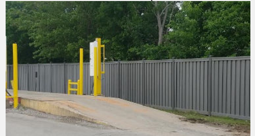
Scale Station - Tulsa, OK