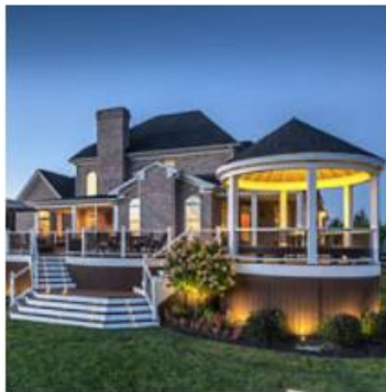
TREX OUTDOOR LIGHTING