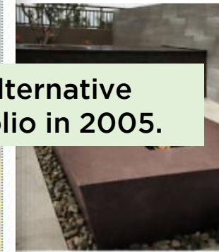
TREX OUTDOOR FIRE & TER