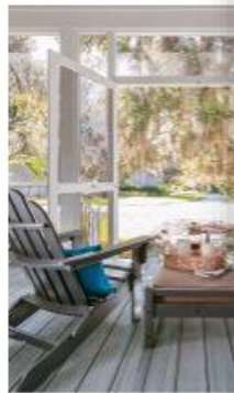
FURNITURE & O KITCHENS