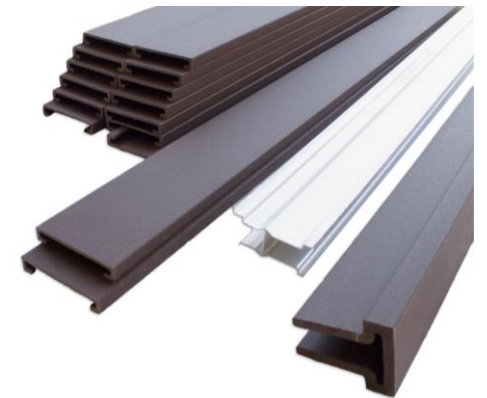
Trex Fencing panels are assembled in the field