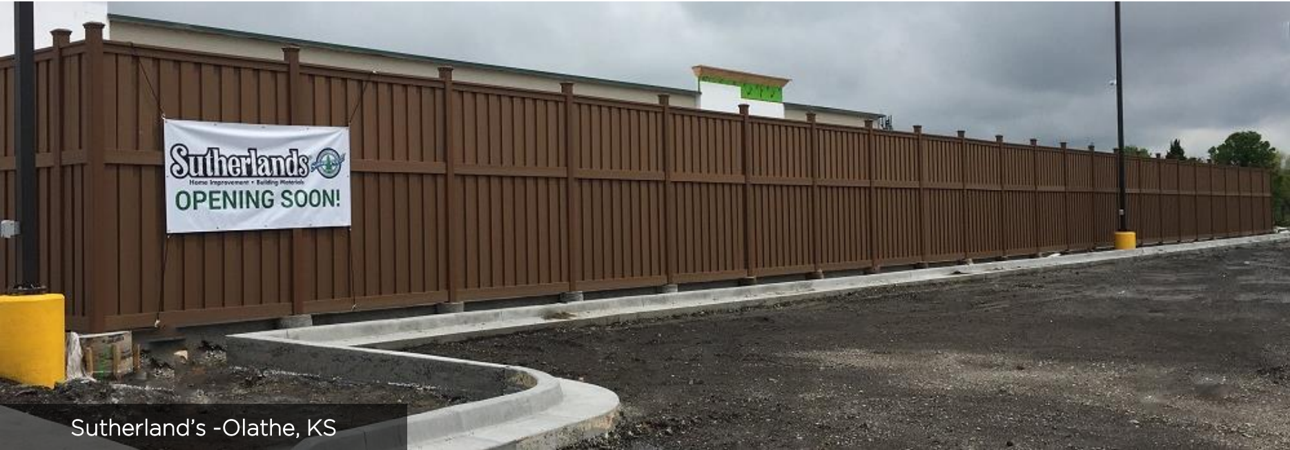
Sutherland's - Olathe, KS