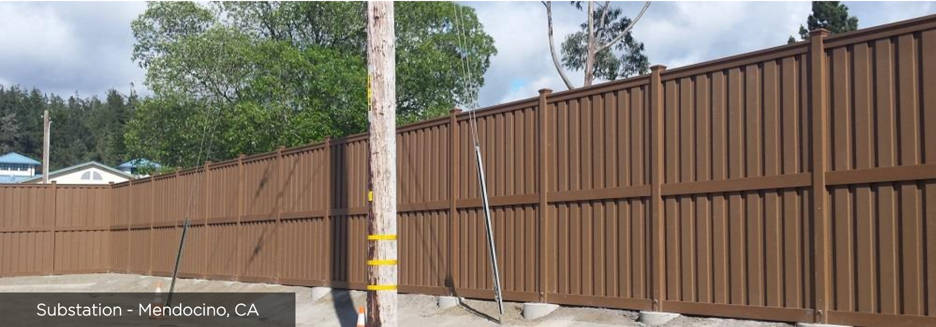
Substation - Mendocino, CA