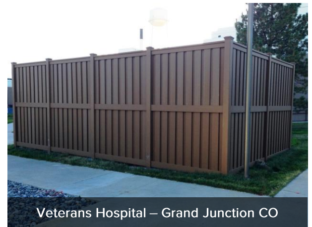
Veterans Hospital – Grand Junction CO