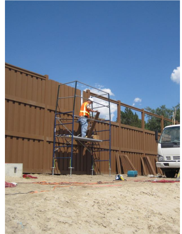
Pickets are interlocked and the top rail is placed over the pickets to ensure fence is secure

Fence is constructed in an assembly line fashion