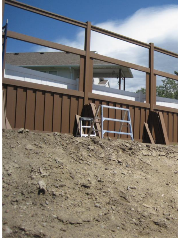
Fence is built from the bottom up using intermediate aluminum rails with composite covers