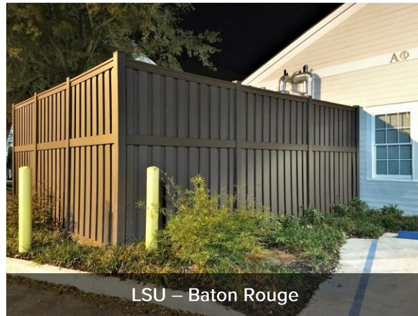
LSU – Baton Rouge