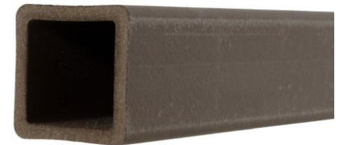
5"x5" Composite Post sleeve over Steel Post Stiffener

Steel Post Stiffeners are used with Trex® Composite Posts