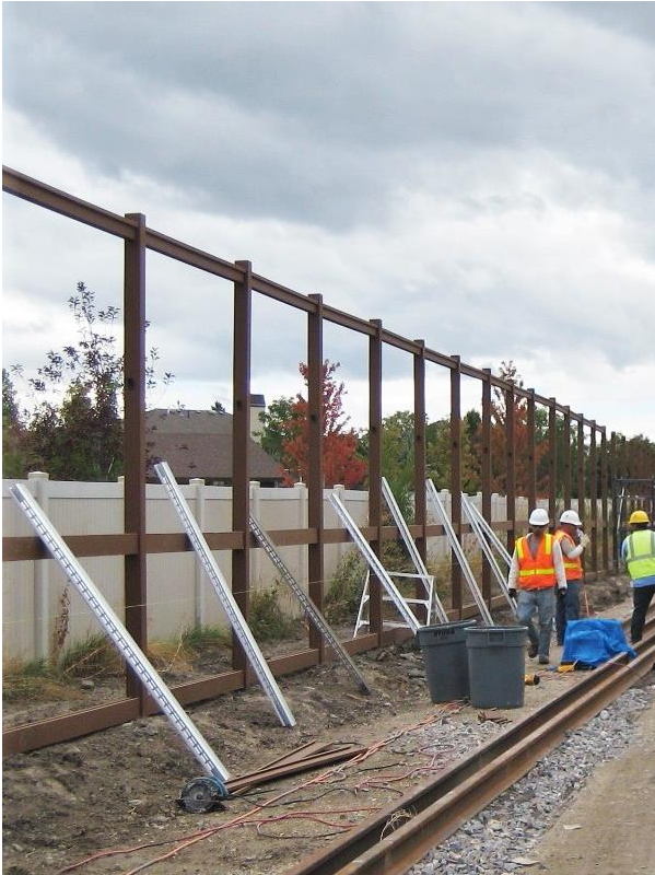
Rails are placed temporarily for accurate measurements