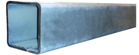
3.5"x3.5"x3/16" Galvanized Steel Post Stiffeners are set in concrete