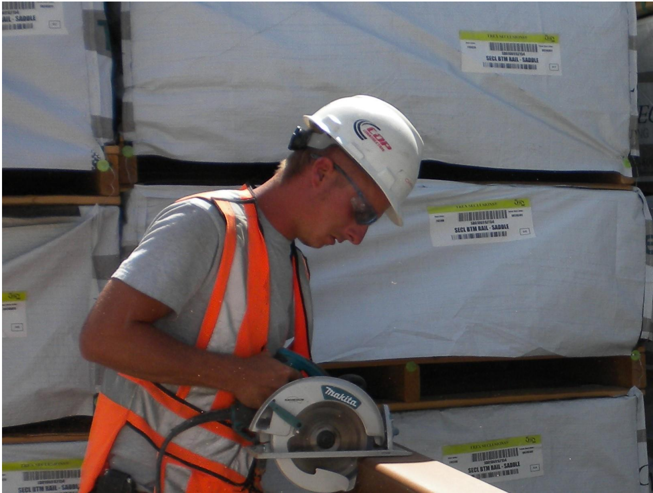
Rails and Pickets are cut to length