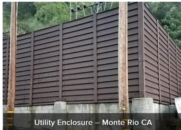
Utility Enclosure – Monte Rio CA