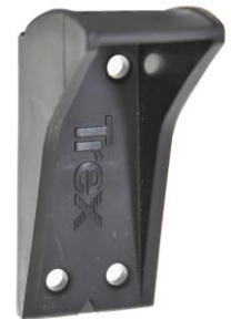
Glass-filled Nylon, Heavy Duty Fence Brackets