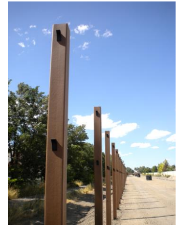
Brackets are attached to the Composite Posts at Rail Points