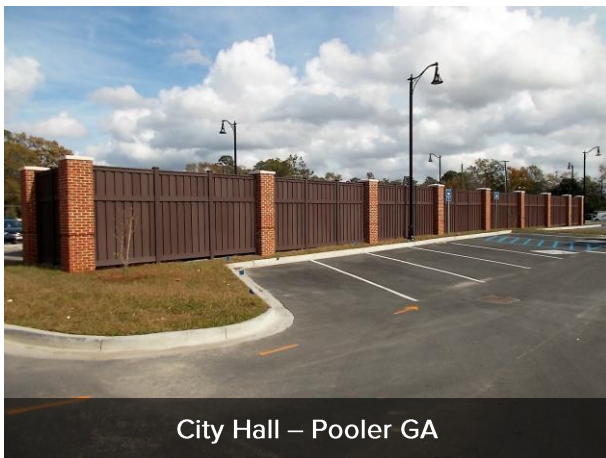
City Hall – Pooler GA