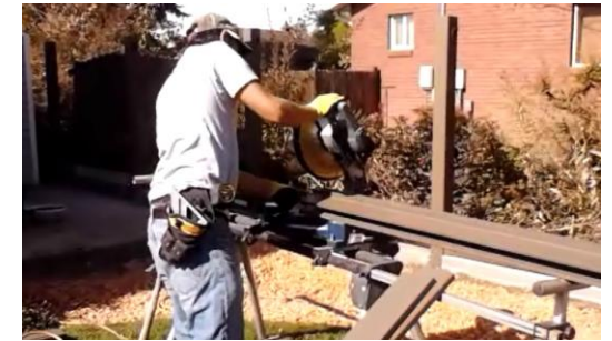
Trex materials are cut with miter and circular saws (non-ferrous blade is used for aluminum rails)