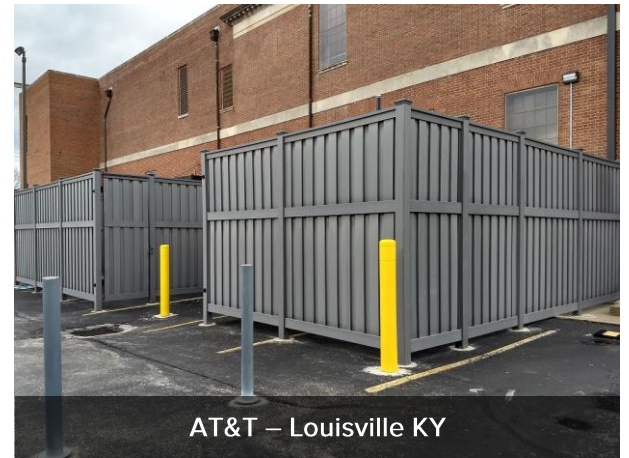
AT&T – Louisville KY