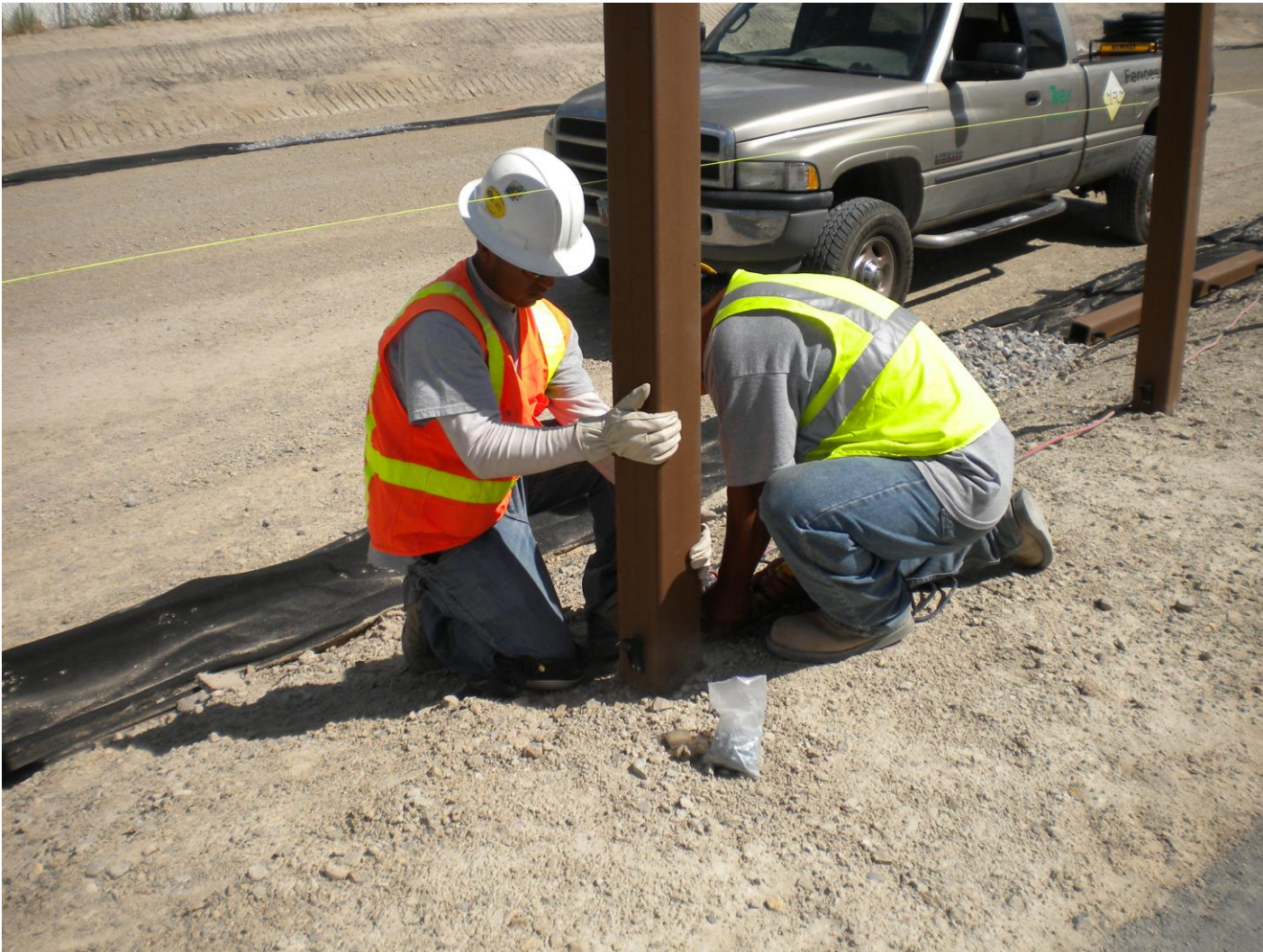
Fence Brackets are used for rail mounting