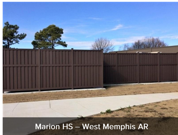
Marion HS – West Memphis AR