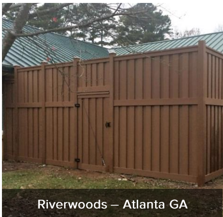
Riverwoods – Atlanta GA