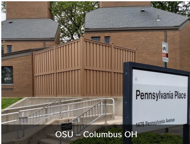
OSU – Columbus OH