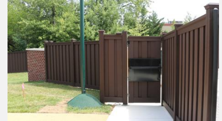
ECD School – Ellicott City, MD