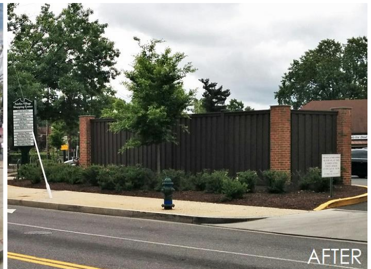
Shopping Center, Washington, DC