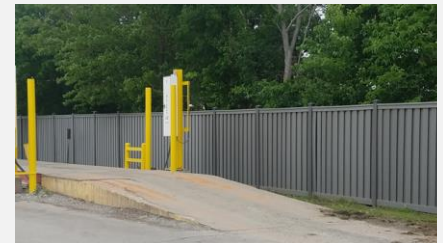
Scale Station – Tulsa, OK