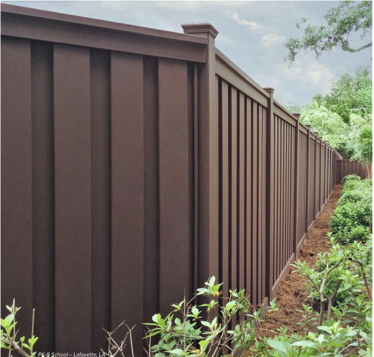
PK-8 School – Lafayette, LA