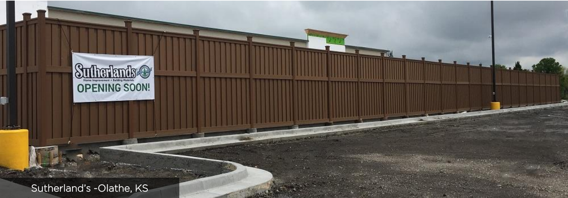
Sutherland's - Olathe, KS