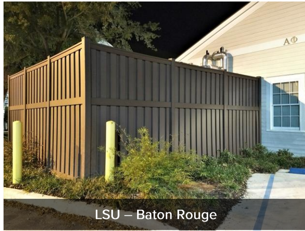
LSU – Baton Rouge