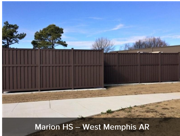
Marion HS – West Memphis AR