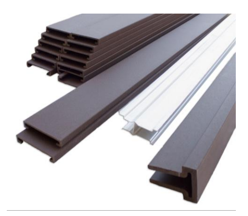
Trex Fencing panels are assembled in the field