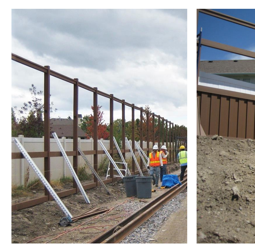
Rails are placed temporarily for accurate measurements

Fence is built from the bottom up using intermediate aluminum rails with composite covers