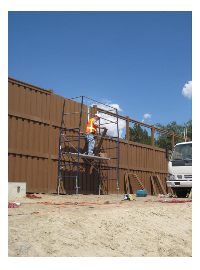
Pickets are interlocked and the top rail is placed over the pickets to ensure fence is secure

Fence is built from the bottom up using intermediate aluminum rails with composite covers