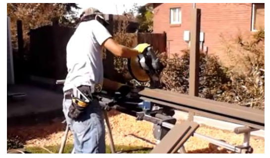
Trex materials are cut with miter and circular saws (non-ferrous blade is used for aluminum rails)