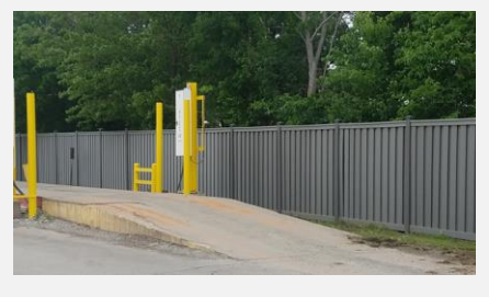
Scale Station – Tulsa, OK