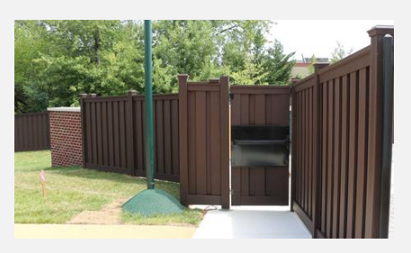
ECD School – Ellicott City, MD