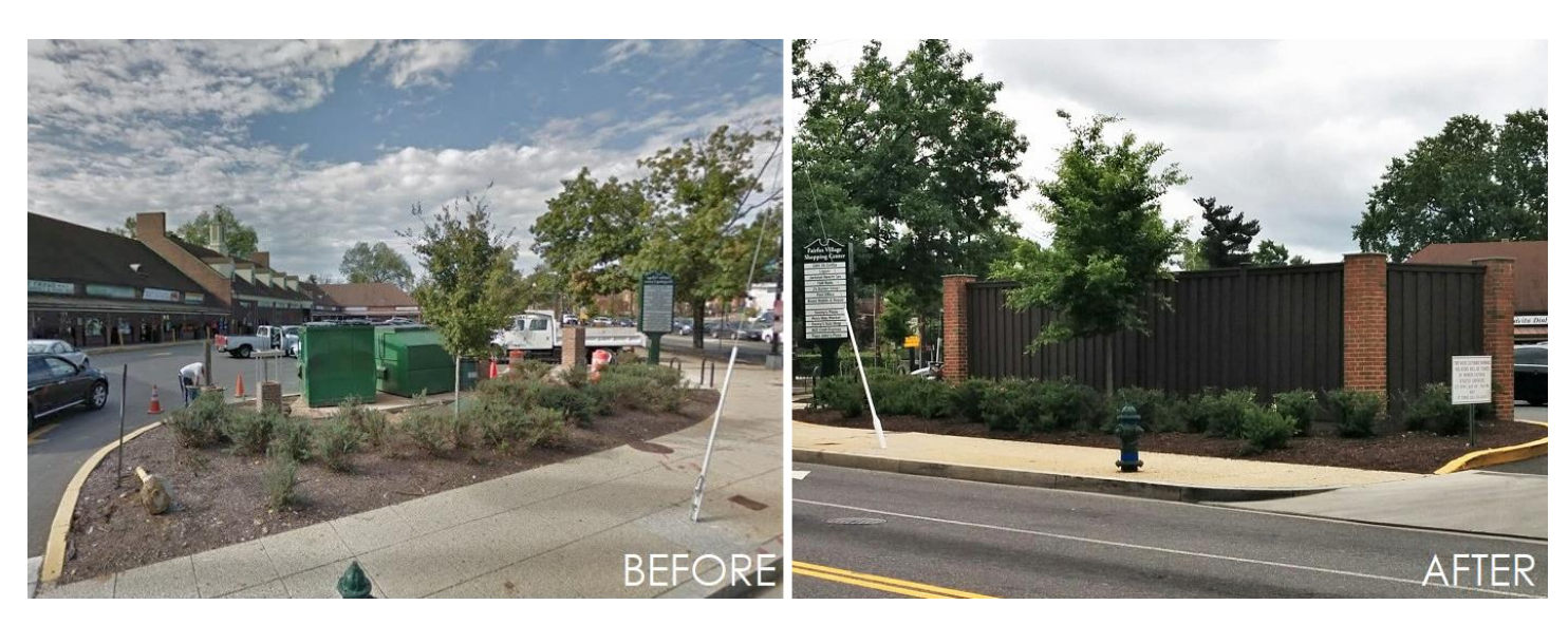
Shopping Center, Washington, DC