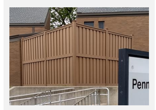
University Housing – Columbus, OH