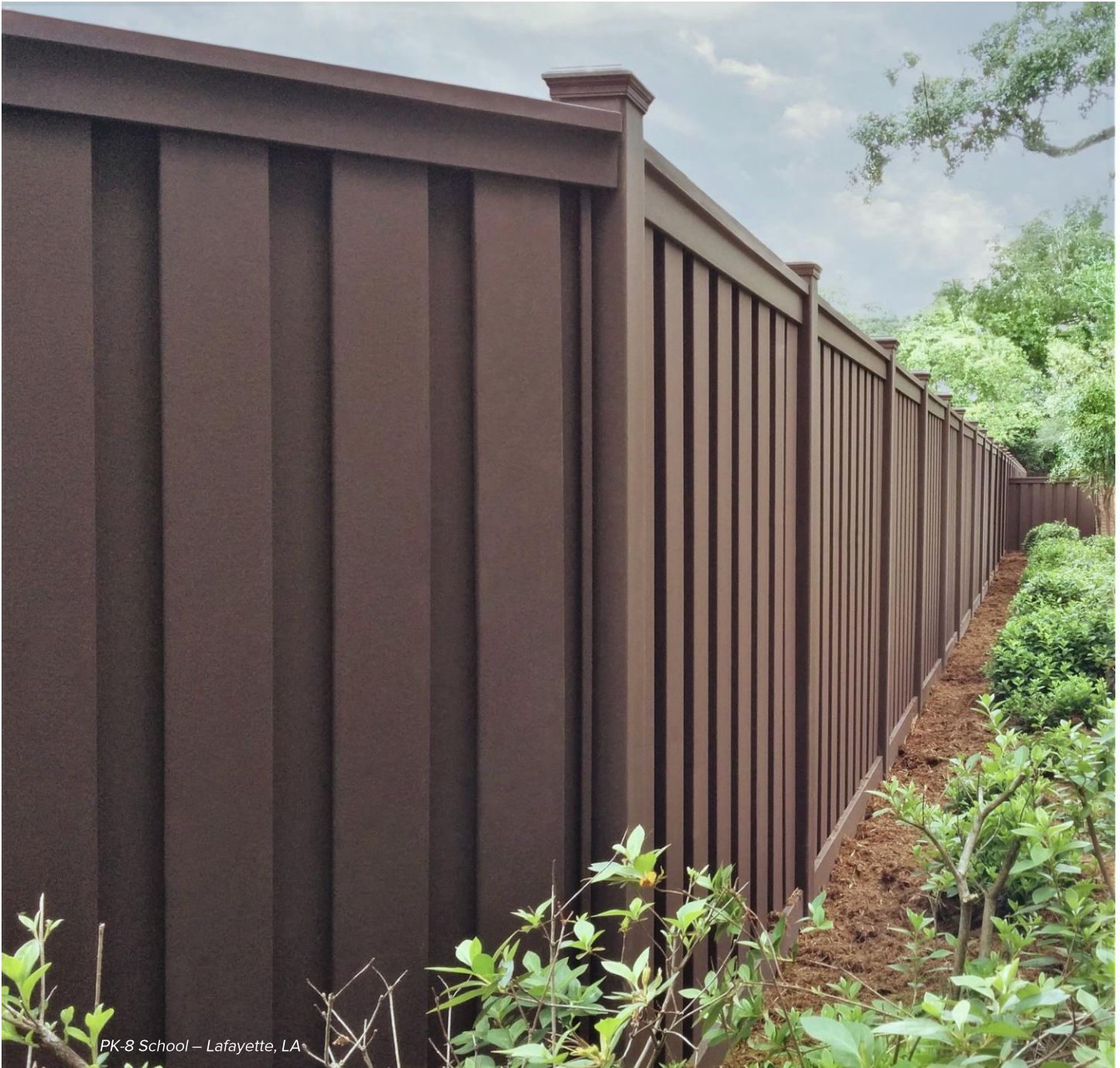
PK-8 School – Lafayette, LA