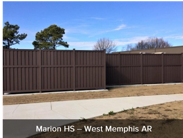
Marion HS – West Memphis AR