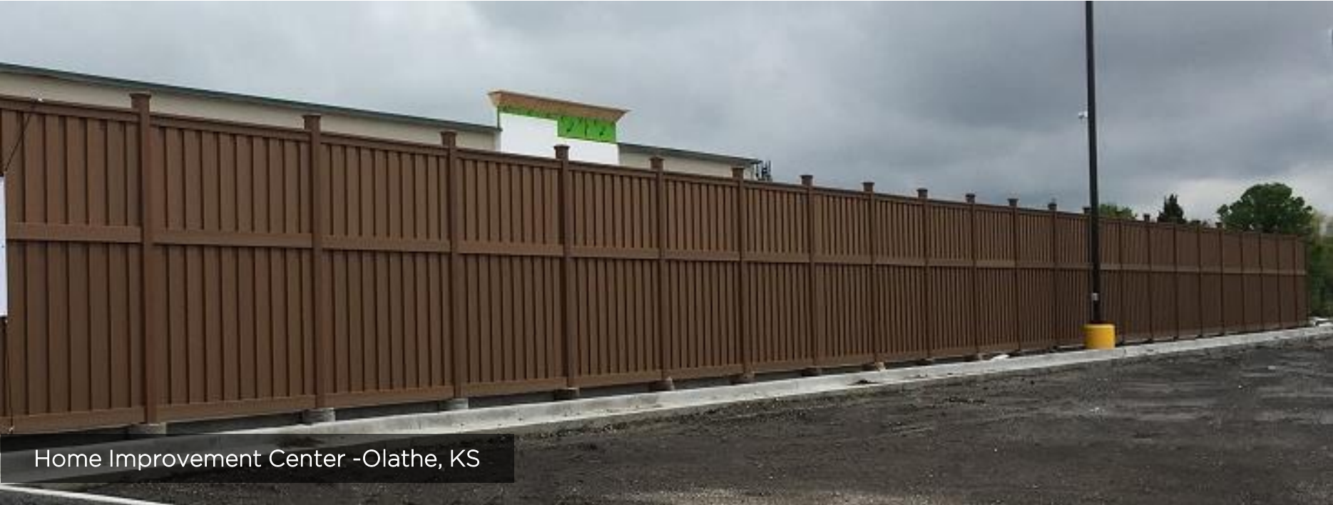
Home Improvement Center -Olathe, KS